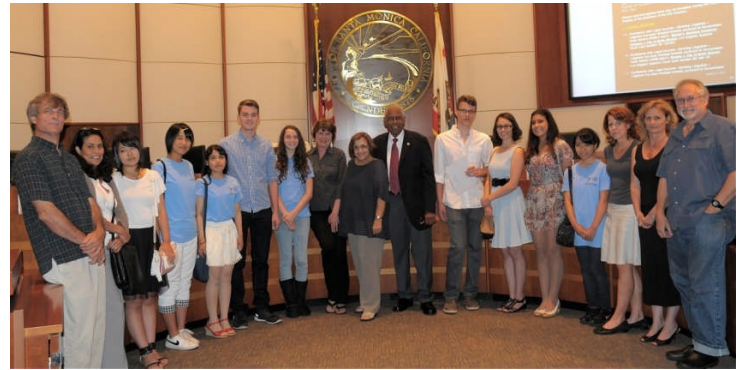
At Santa Monica City Council meeting