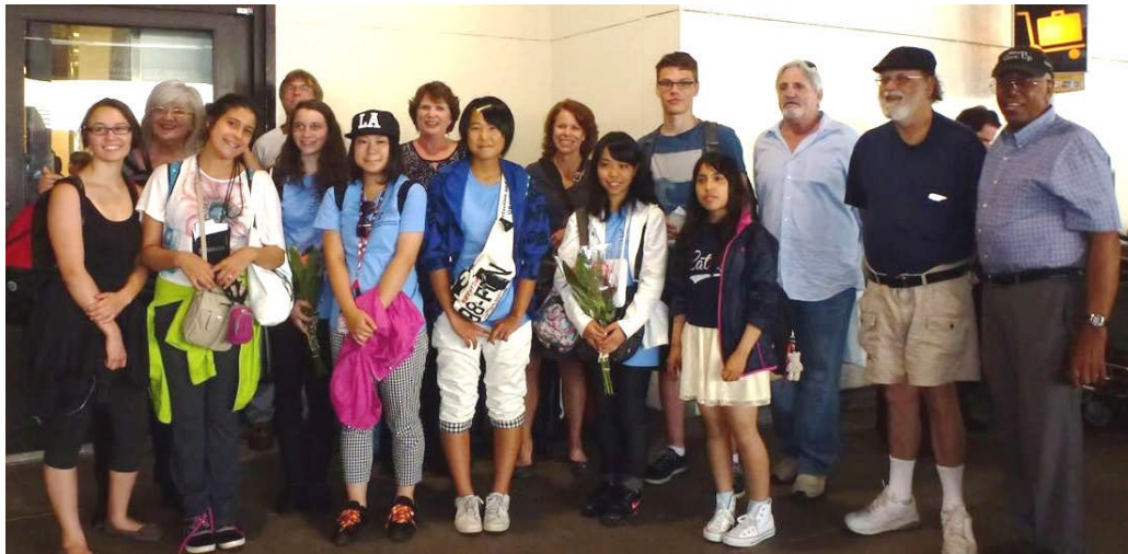
A sad farwell at LAX after spending an entire month together.