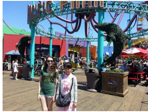
Santa Monica Pier