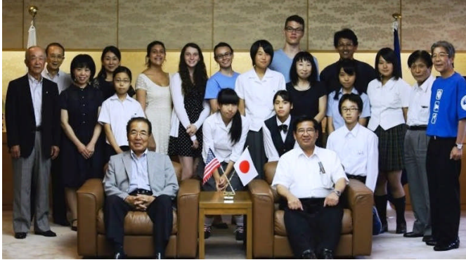
In Fujinomiya City Hall