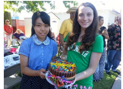
Sharing our American food