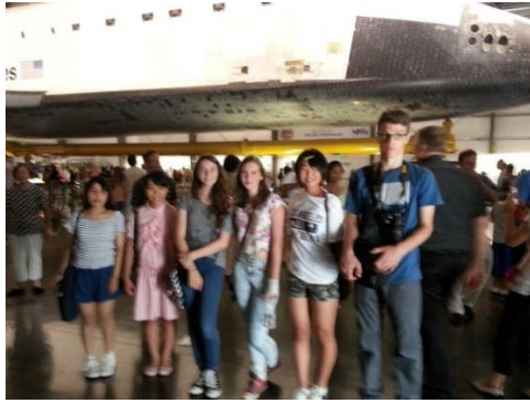
California Science Center