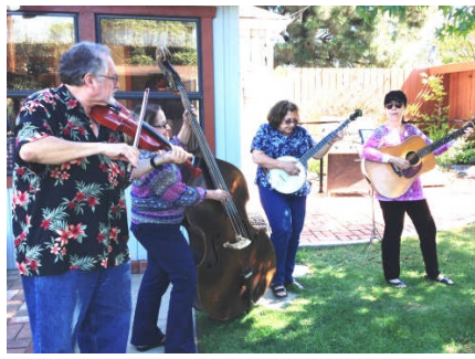
The Old Time String Band entertains us